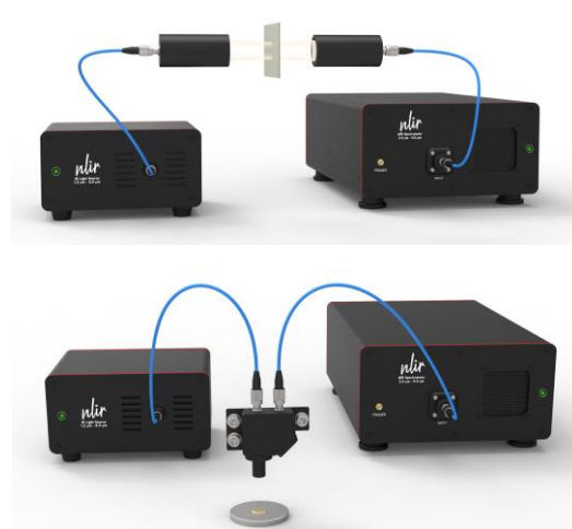
Schematics of NLIR light source and infrared spectrometer setup for coatings; transmission (top) and reflection (bottom)

One of the biggest challenges in coating inspection is ensuring optimal light guidance to and from the sample. That's why we've developed two simple fiber-coupled interface bundles for optical coating inspection that are specifically designed to address this issue. Whether you need to measure samples in transmission or reflection, our interfaces can help you get started and achieve accurate results quickly. Plus, with a minimum detectable power of only 5 pW/nm in our spectrometer, even dark or low-reflective samples can be measured with ease.